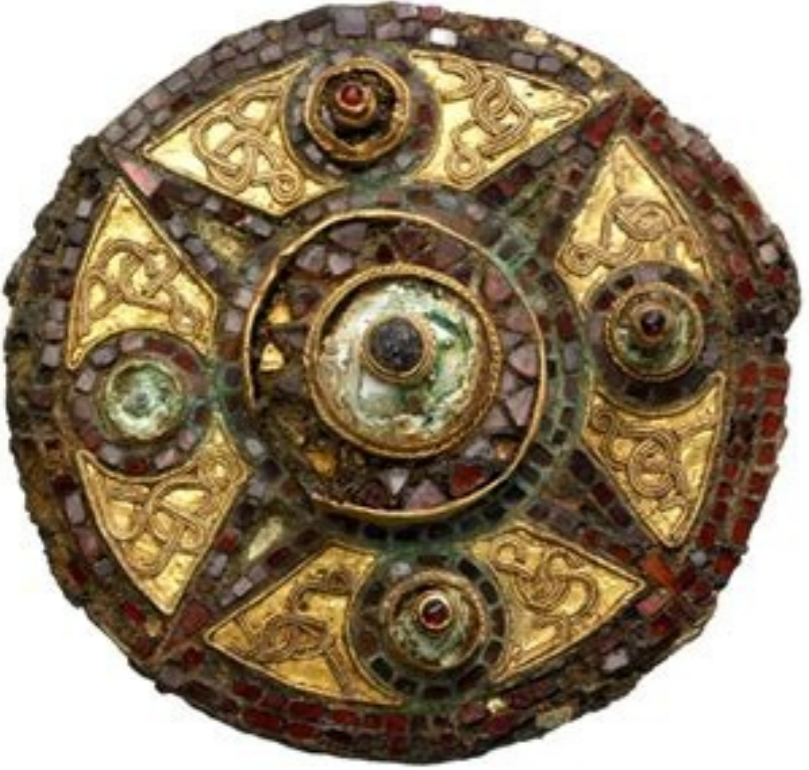
How to make an anglo-saxon shield.